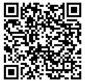
A FREE LIMO ENGAGEMENT CELEBRATION CRUISE